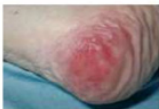
Figure 1. Illustrations of Stage 1 and 2 Pressure Ulcers 5

This leads us then not so much to the cushion, as to its cover. The majority of pressure ulcers recorded are Stage 1 or 2, and these occur at the epidermis and dermis, the outer layers of the skin (see Fig. 1). What affects these outer layers of the skin is what is closest to the skin i.e. one's clothing and the cover on the cushion. If these items can move with the skin as the person moves in their seat, there will be less risk of shear damage (from shear stress and shear strain) to the skin. Likewise, if the clothing and cover materials control the microclimate from temperature and humidity build up around the skin, there will be less risk of skin damage arising from maceration of the skin.